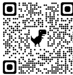
Oita Prefectural Art Museum